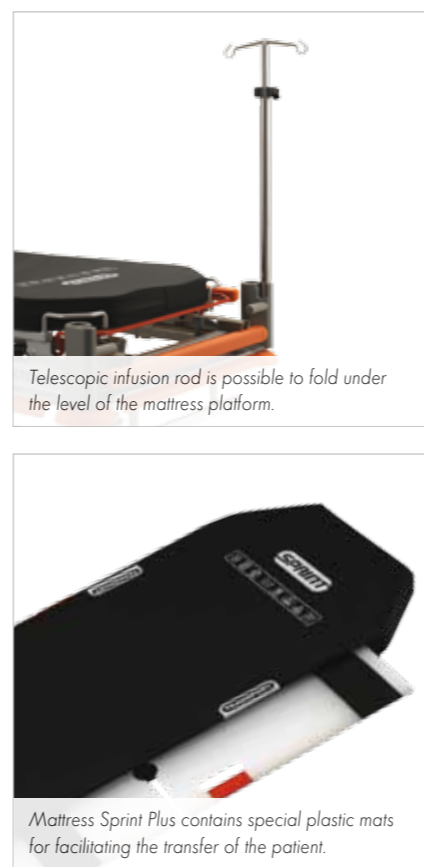
Mattress Sprint Plus contains special plastic mats for facilitating the transfer of the patient.