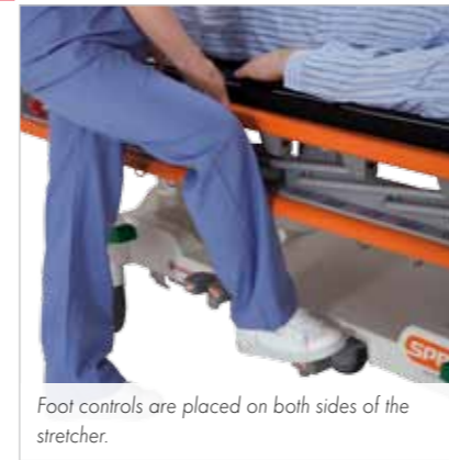
Foot controls are placed on both sides of the stretcher.