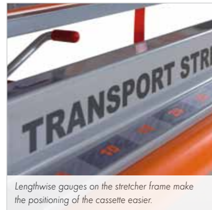
Lengthwise gauges on the stretcher frame make the positioning of the cassette easier.