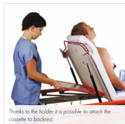
Thanks to the holder it is possible to attach the cassette to backrest.