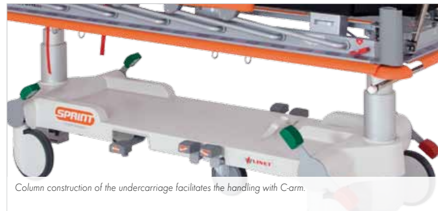
Column construction of the undercarriage facilitates the handling with C-arm.