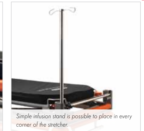
Simple infusion stand is possible to place in every corner of the stretcher.