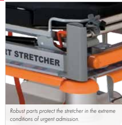
Robust parts protect the stretcher in the extreme conditions of urgent admission.