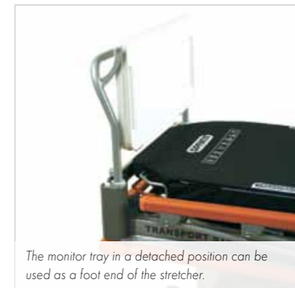
The monitor tray in a detached position can be used as a foot end of the stretcher.