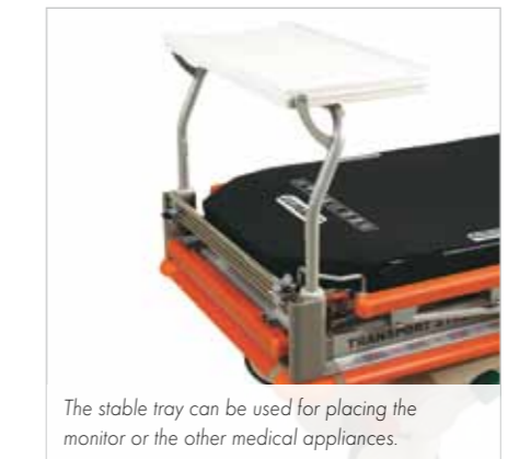
The stable tray can be used for placing the monitor or the other medical appliances.

The range of accessories of the stretcher SPRINT enable the parameters of the stretcher to conform to specific requirements in various hospital wards. ■ Monitor tray ■ Vertical holder for 5L oxygen bottle ■ Simple riding handrails ■ Simple infusion stand with two hooks ■ Restraint belts