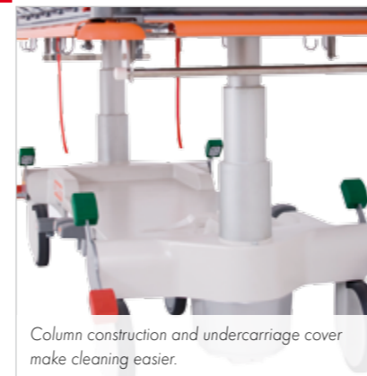
Column construction and undercarriage cover make cleaning easier.