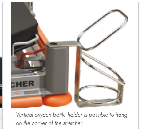
Vertical oxygen bottle holder is possible to hang on the corner of the stretcher.