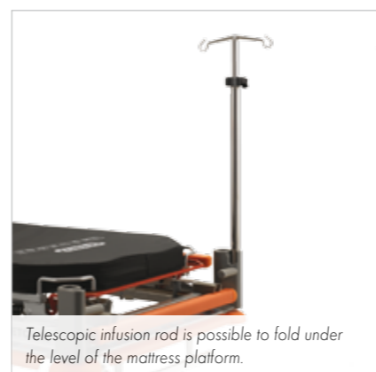
Telescopic infusion rod is possible to fold under the level of the mattress platform.