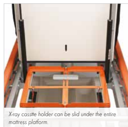
X-ray cassette holder can be slid under the entire mattress platform.