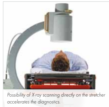
Possibility of X-ray scanning directly on the stretcher accelerates the diagnostics.