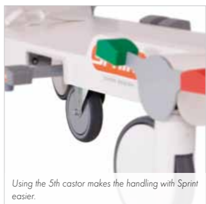
Using the 5th castor makes the handling with Sprint easier.